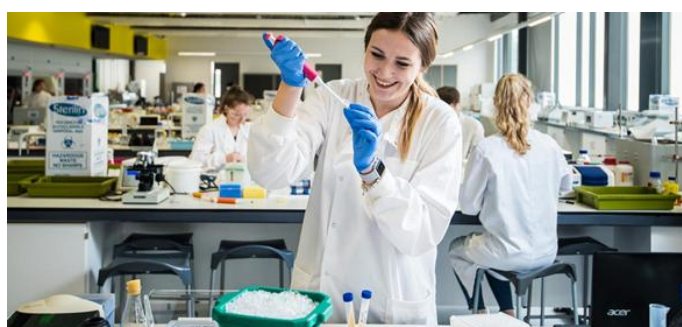
The Power to Change Lives: Biomedical Sciences at Lancaster

Join Lancaster on Monday 17th November for an inspiring online webinar exploring how studying Biomedical Science or Biomedicine at Lancaster University can set you on a path to make a real difference in the world. Designed for Sixth Formers, this session will introduce you to the exciting world of biomedical research, the career opportunities it opens up and what it's like to study at a top UK university. Discover how you could be part of the next generation of scientists changing lives through innovation in healthcare.