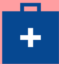
Pathways to Veterinary Medicine at Nottingham University

The Sutton Trust currently have space on their Pathway to Law and Pathway to Veterinary programmes. These programmes are exclusively for Lower 6 th state educated pupils and offer a valuable insight into these competitive professions.