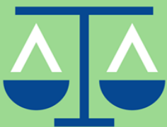
Pathways to Law at the University of Exeter